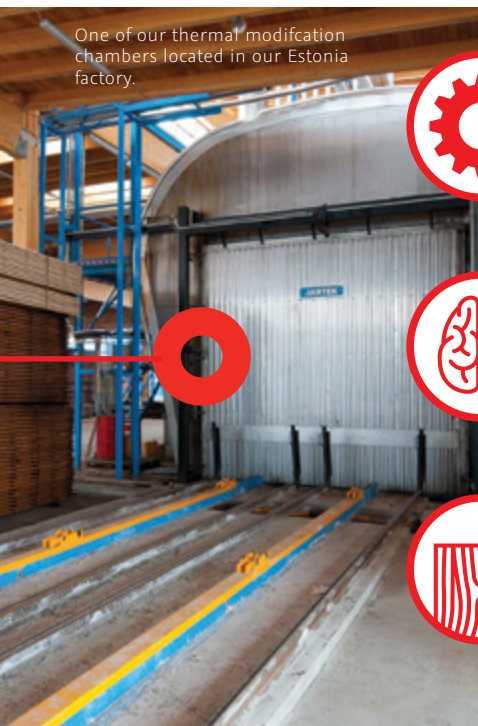
One of our thermal modification chambers located in our Estonia factory.