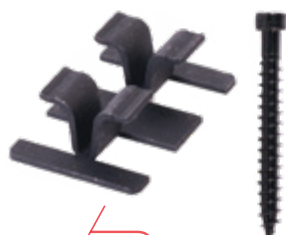
T4 (4") T6 (6")